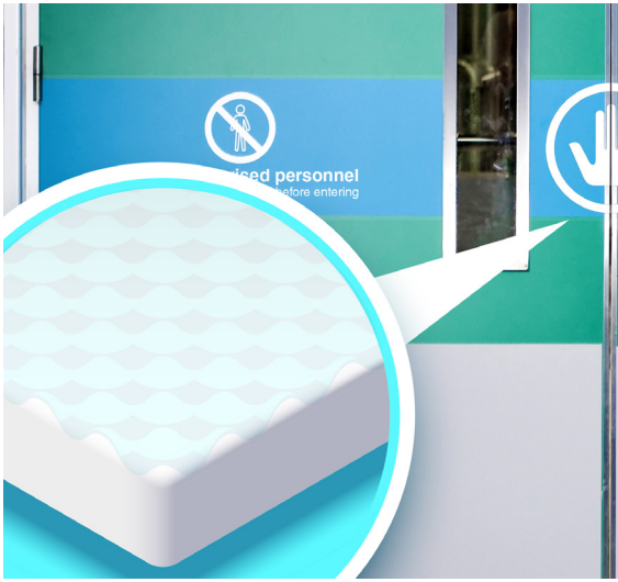
1. Full Integration

Protac AMP is Durable, Cleanable and Antimicrobial.