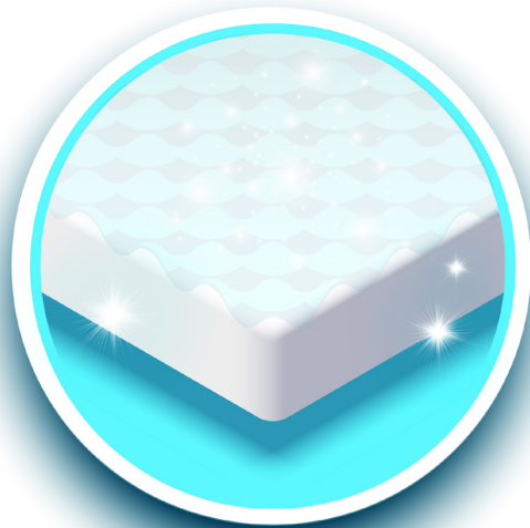
4. A Cleaner Surface

The technology disrupts the vital life process and biological functions of the bacteria. This means they cannot reproduce and subsequently die.